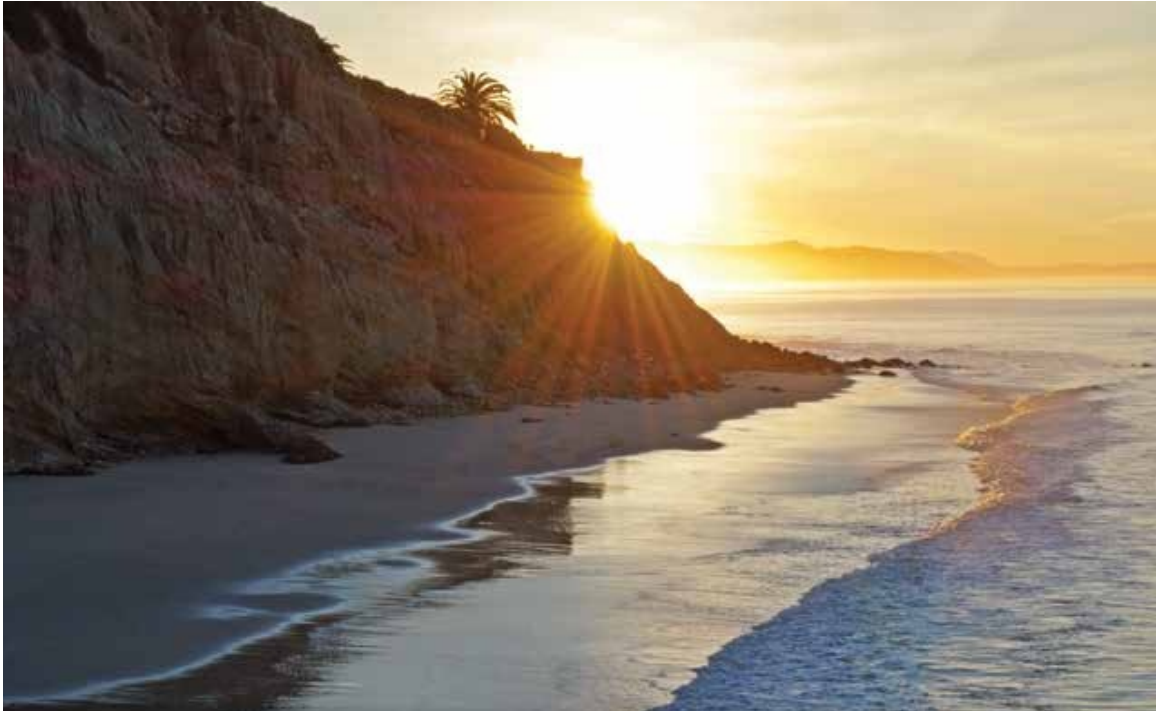
Top to bottom: Summerland Beach, Santa Barbara Polo & Racquet Club