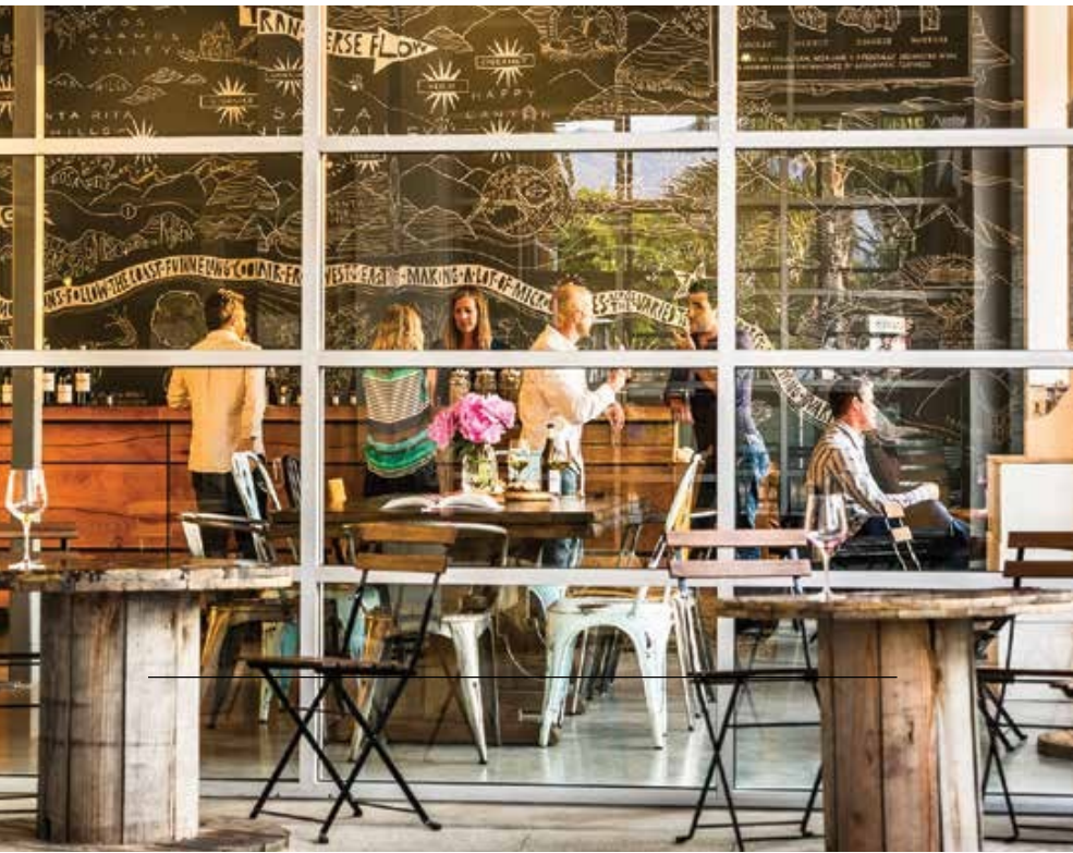
Clockwise from opposite left: Santa Barbara Farmers' Market, The Valley Project, Rosé at Margerum Tasting Room, Santa Barbara County Courthouse