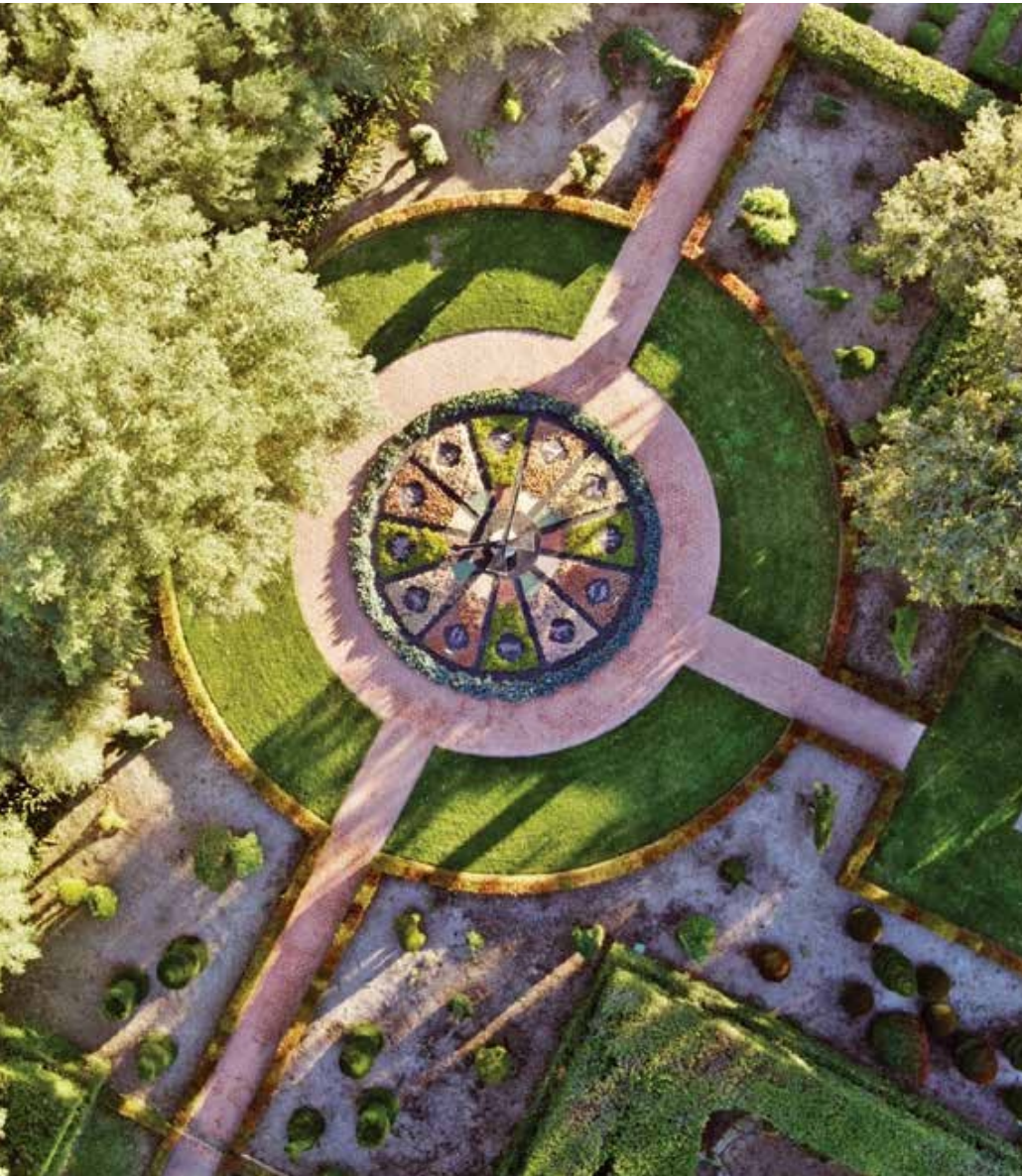
Left to right: Ganna Walska Lotusland, Coast Village Road